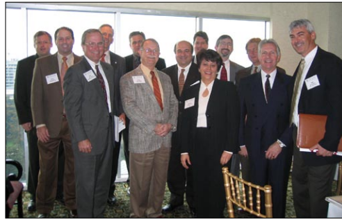
Members of CELSOC San Diego attended the annual Legislative Visit Day January 30, 2006